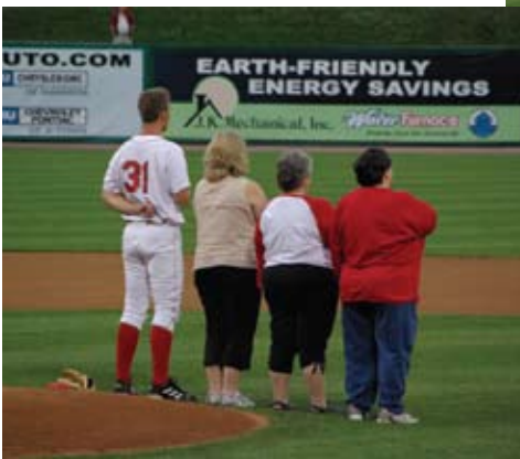
Booster Club members as the Field of Dreams team during the National Anthem.

As we begin planning our 2009 season activities, it's important to remember that new memberships will increase our funding, enabling us to do more things for the team