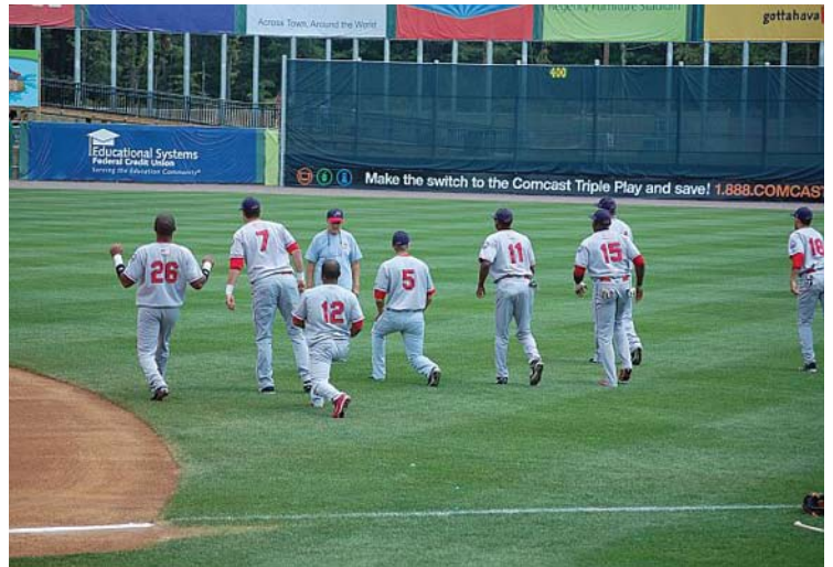
The 'Stormers warm up before a game at Southern Maryland.