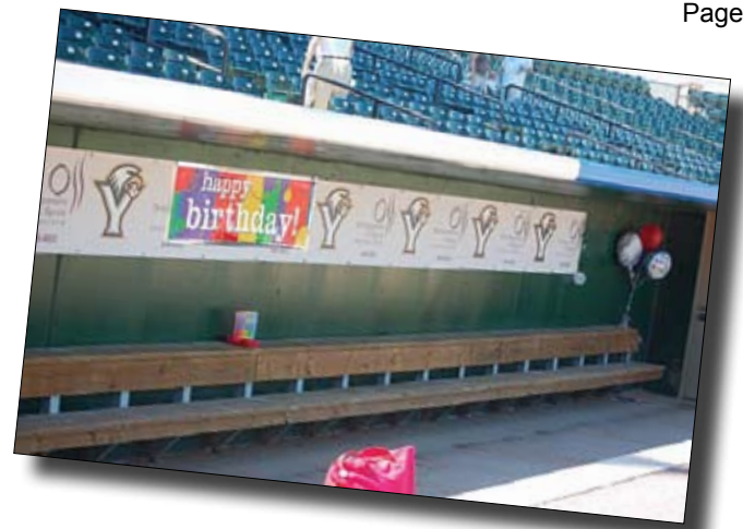
A little bit of "home" at an away game, a birthday banner graces the visitor's dugout when we played York.