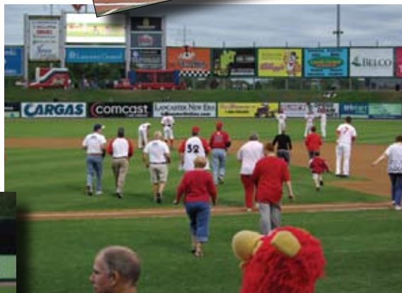
The Booster Club Field of Dreams participants take to the field.

out on the field and stand next to their favorite player(s) during the National Anthem. It was a fun, thrilling experience for all members who participated.